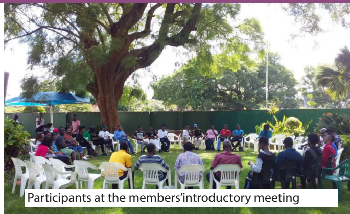
Participants at the members' introductory meeting

The process required the management to assess the political, social and economic environment taking into ac-